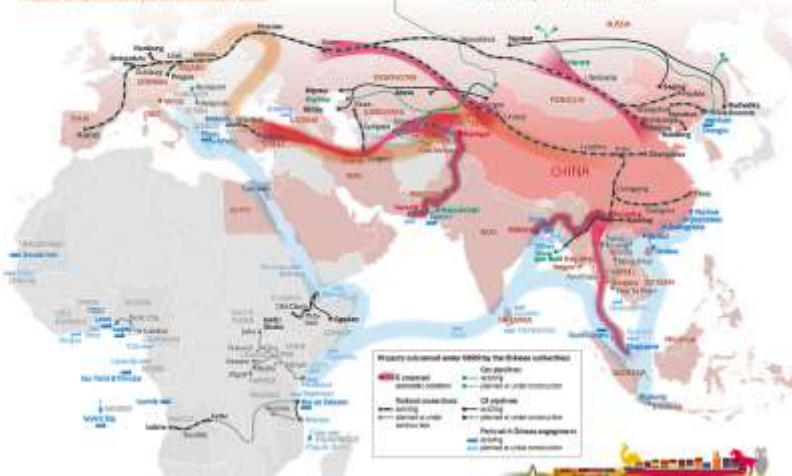
MERICs China Mapping One Belt, One Road: With the Silk Road Initiative, China Aims to Build a Global Infrastructure Network Projects completed and planned December 2015

Instead, what we see now are the lesser players scrambling for their place at a newly forming table, the future of which is being indicated by China through its Belt and Road initiative, which is being linked by and through Russia and which will eventually encompass all of Europe and Asia. It is not simply a Chinese project. It is international in its scope. It is a great and unfolding experiment, and it cannot be thwarted by hawks in Washington, nor in Israel, no matter how hard they may try. All countries along that